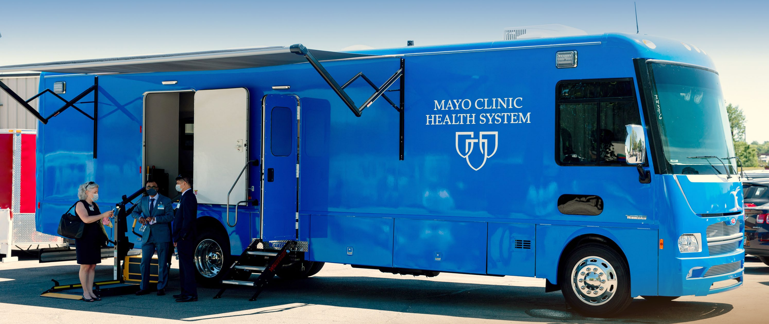
Mobile Clinic, rural MN